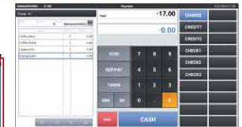
Support panel display examples