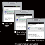
① Sales flash report ② Reservations flash report ③ Customer flash report ④ Screen shots are simulated. ⑤ Application screens may be updated.