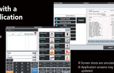
① Screen shots are simulated. ② Application screens may be updated.

The V-R100 comes with a preinstalled sales management application that supports efficient check-out operations. It enables PLU registering as well as the recording and totaling of sales data. Once a product name and unit price have been entered in the system, the operator inputs the price by simply touching the product name on the screen. Sales by product and other information can be confirmed on the screen, a feature useful in sales management and merchandise control at restaurants and shops. In addition, Android supports independent development of custom applications. With the V-R100, ease of use can be customized for specific operations and industries.