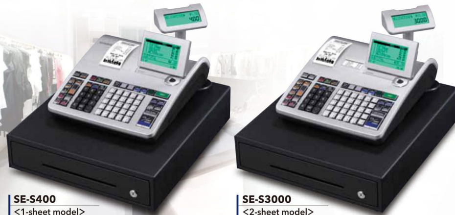
SE-S400 <1-sheet model>