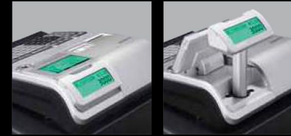
Large pop-up display

An alpha-numeric pop-up customer display ensures high visibility for the customer. Gain trust from your customer with a mistake-free cash register operation.