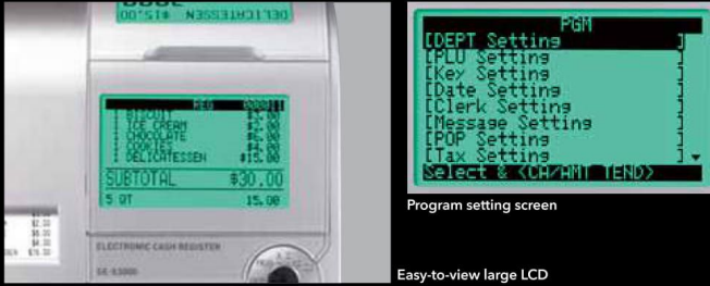
Program setting screen Easy-to-view large LCD

A 10-line display for maximum efficiency and viewability during checkout and program setting. The display features a tilt mechanism to adjust view angles, and the back-light ensures accurate operation in dark environments.