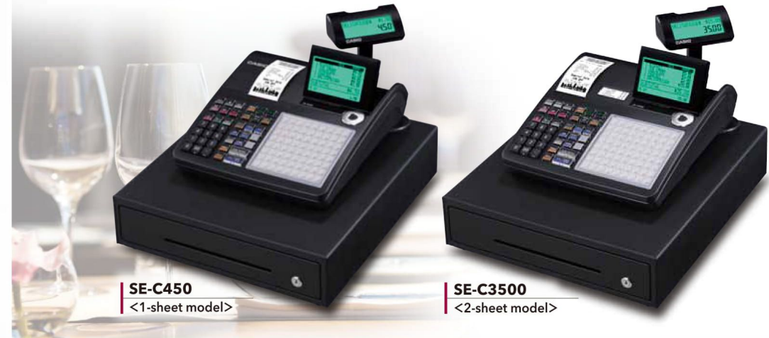
SE-C450 <1-sheet model>